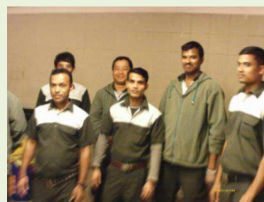
Dream Readymix Staff