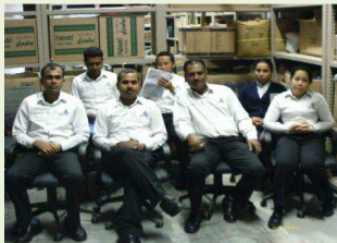
Dream Development Staff